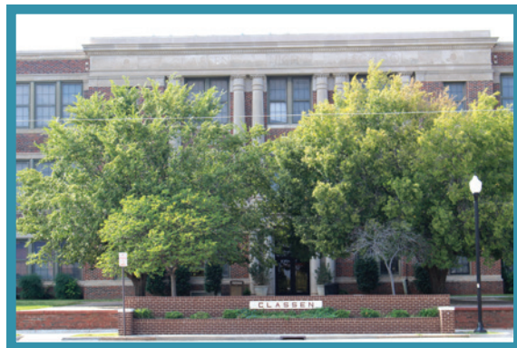
CLASSEN SCHOOL OF ADVANCED STUDIES 3100 N. KELLEY AVE. OKLAHOMA CITY, OK 73111 405.587.5400