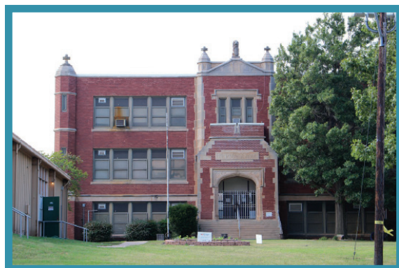
EMERSON NORTH HIGH SCHOOL 715 N. WALKER AVE. OKLAHOMA CITY, OK 73102 405.587.7900