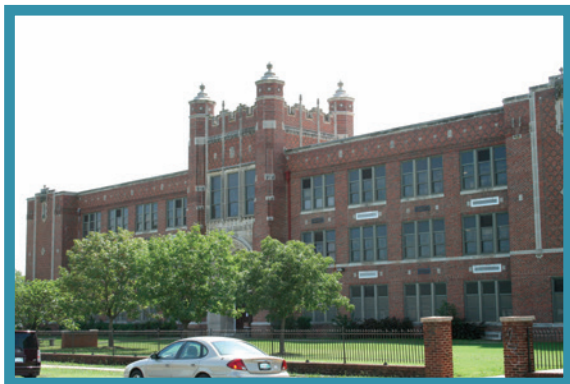
CAPITOL HILL HIGH SCHOOL 500 SW 36TH ST. OKLAHOMA CITY, OK 73109 405.587.9000