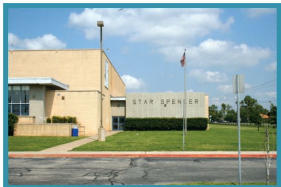
STAR SPENCER MID-HIGH SCHOOL 3001 N. SPENCER RD. SPENCER, OK 73084 405.587.8800