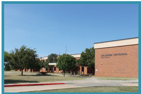
PUTNAM HEIGHTS ACADEMY 405.