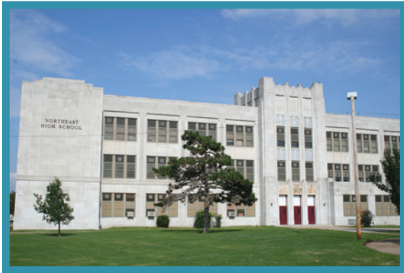
NORTHEAST ACADEMY 3100 N. KELLEY AVE. OKLAHOMA CITY, OK 73111 587-3300