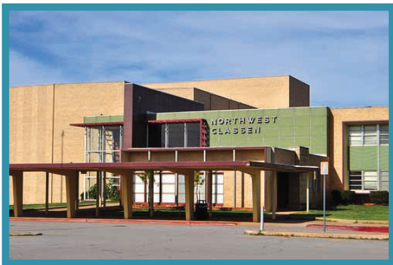
NORTHWEST CLASSEN HIGH SCHOOL 2801 NW 27TH ST. OKLAHOMA CITY, OK 73107 405.587.6300